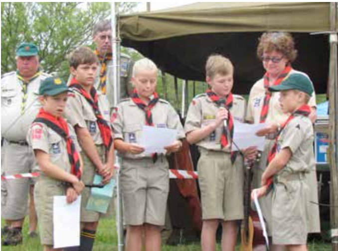
1st Kloof scouts lead the Boys Own service.